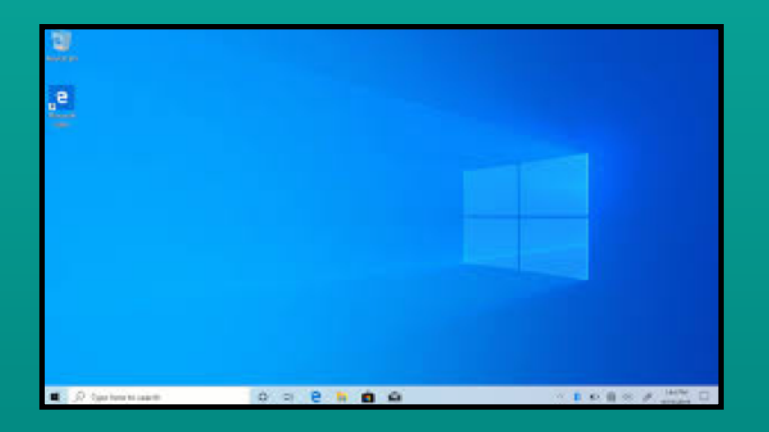
READ More on - https://support.microsoft.com/en-us/help/4057281/windows-7-support-will-end-on-january-14-2020

Recommendations are to move to a new device with Windows 10. Newer PC's are faster, lightweight and more secure. A newer machine will provide more security and less headache about utilizing software and devices and services that are currently available.