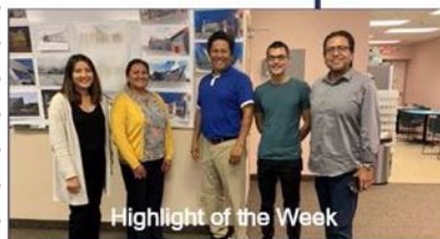
Highlight of the Week