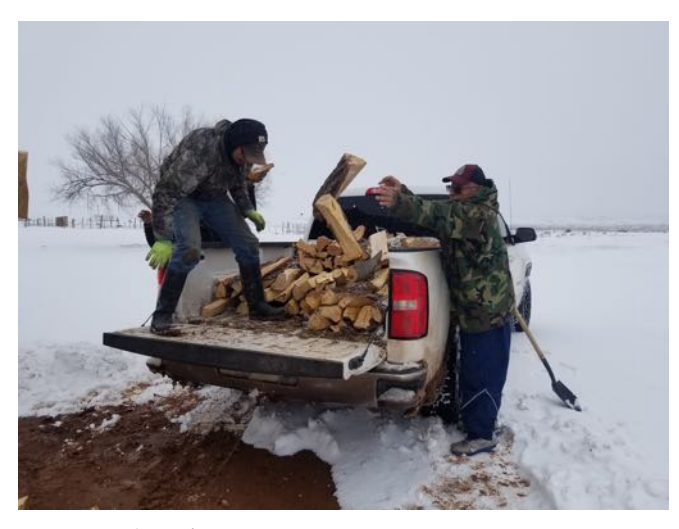
VP Unloading Vice President assisting in unloading. — at Lukachukai Chapter Government.