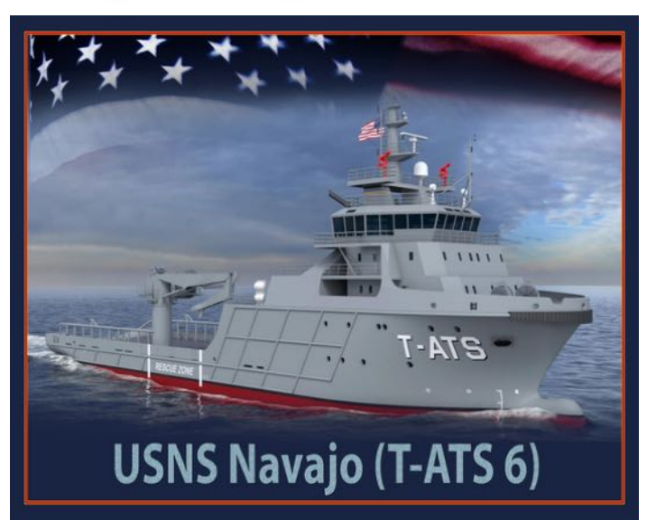
PHOTO: A mockup from the shipbuilder of the class of U.S. Navy Towing, Salvage, and Rescue ships.

WINDOW ROCK, Ariz. – The Navajo Nation proudly announces that Secretary of the Navy Richard V. Spencer has named the new class of U.S. Navy Towing, Salvage, and Rescue ships Navajo. The class is named in honor of the Navajo people's storied contributions to the American military, who have served in the armed forces for decades at a higher degree than the national participation rate.