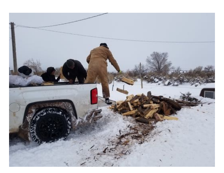
OS -- VP

Breaking through about 10" of snow. — at Lukachukai Chapter Government