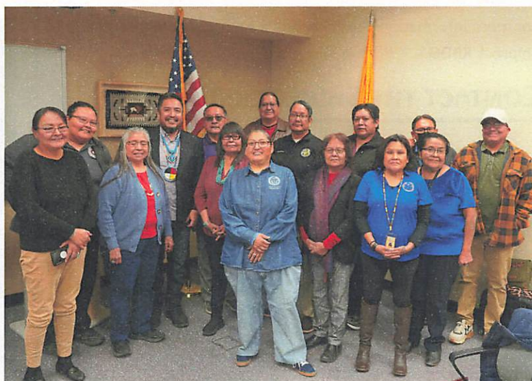
Farmington, NM—The Shiprock RBDO hosts RBDO staff from across the Navajo Nation in Farmington in December for Leasing Regulations training.