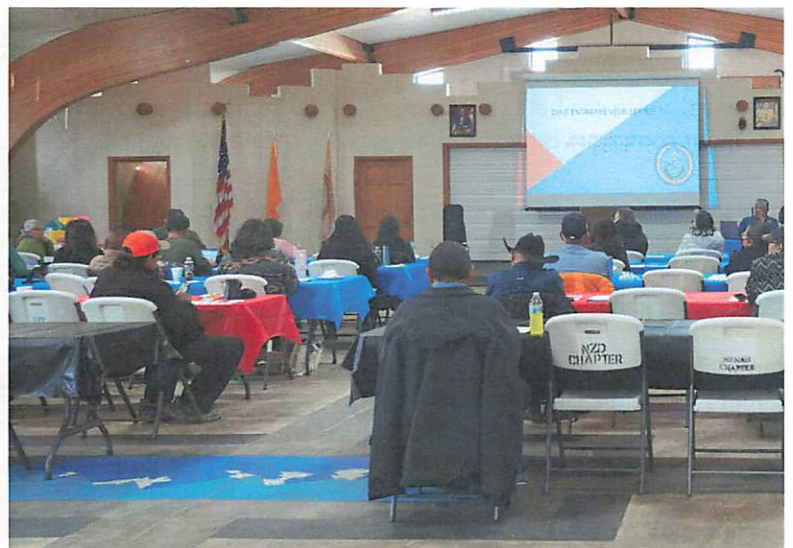
Nenahnezad, NM —Shiprock RBDO staff make presentations about the Navajo Nation Business Site Lease process and the 2008 Uniform Leasing Regulations.