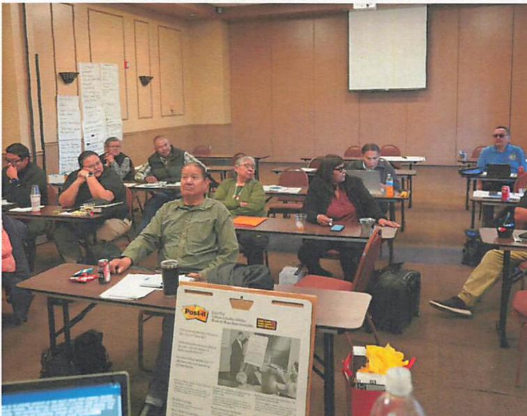
Camp Verde, AZ — RBDO staff participating in Strategic Planning session for the Small Business Development Department