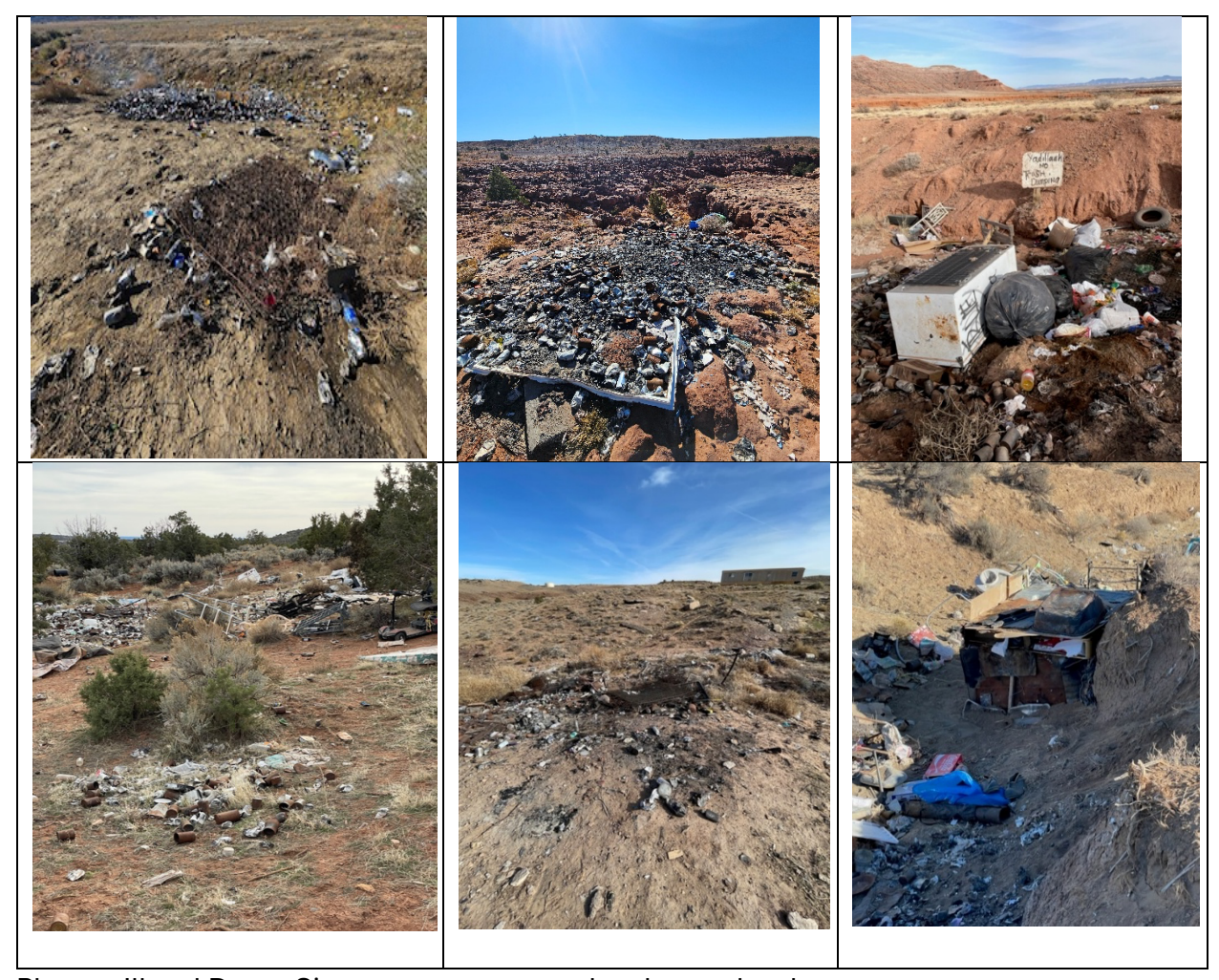
Report by: Lyman Tullie, Senior Planner – SOLID WASTE PROGRAM

Photos: Illegal Dump Sites assessments at the chapter level