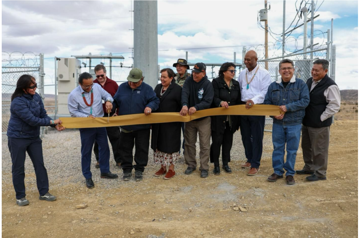
President Buu Nygren and Speaker Crystalyne Curley attended a ribbon cutting ceremony for Jeehdeez'a Broadband Tower in Low Mountain, Feb. 10.

"While the community celebrates, they have also