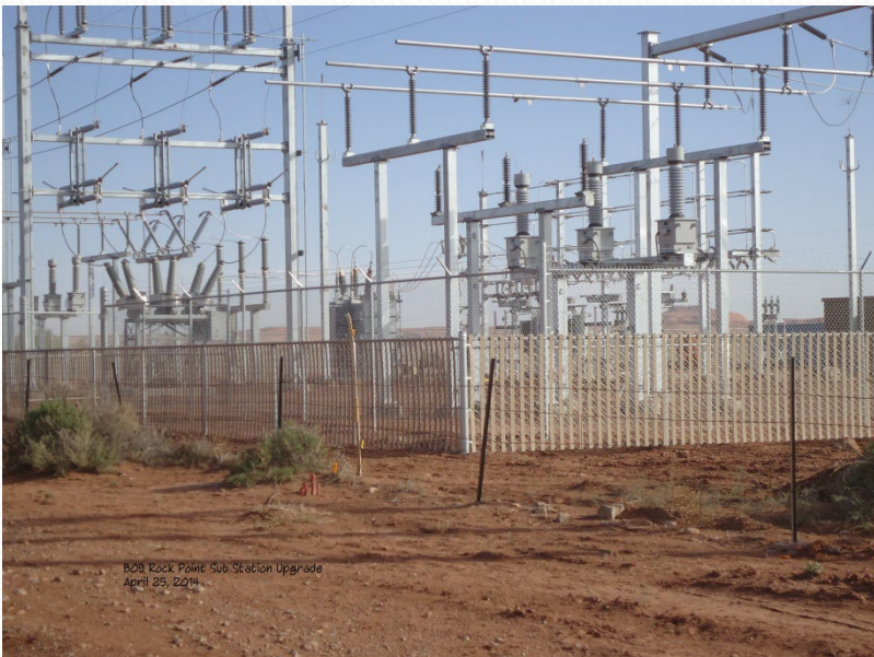
809 Rock Point Sub Station Upgrade April 25, 2014