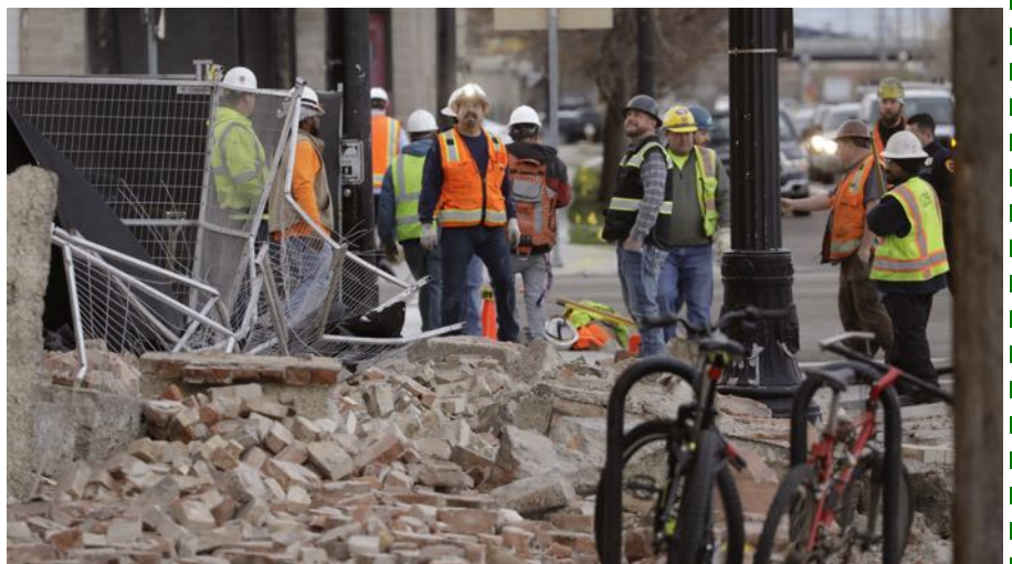
Construction workers at a building after an earthquake in Salt Lake City on Wednesday, March 18, 2020.

The U.S. Geological Survey issued an aftershock forecast. It said there's a 1 in 300 chance of a magnitude 7 hitting in the coming days, while a 6 is a 3% likelihood. A magnitude 5 or higher is a 17% chance.