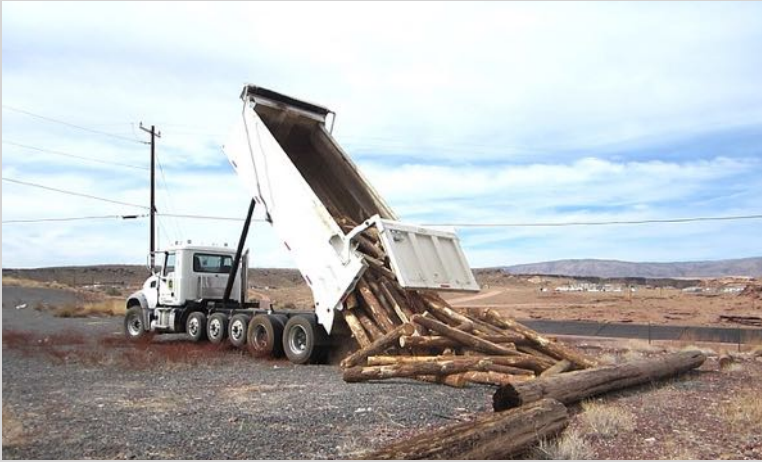
Joe Dirt Excavating delivers wood at the Cameron Chapter House March 6. The delivery is part of a pilot project by the National Forest Foundation, U.S. Forest Service and the Cameron Chapter to provide wood to residents who may not be able to travel to retrieve it from the forests.